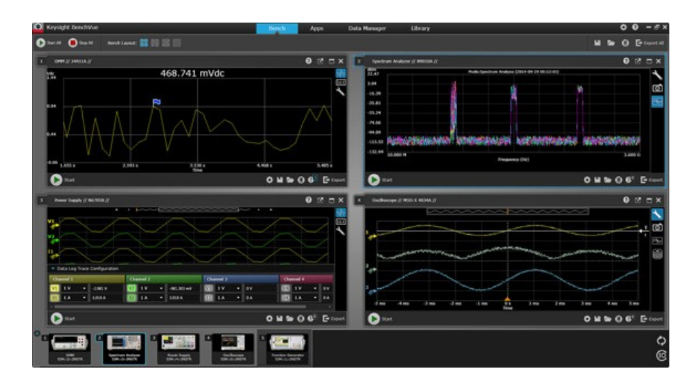
Figure 1. See your measurements across instruments in one place to quickly correlate measurement activities and obtain actionable insights.