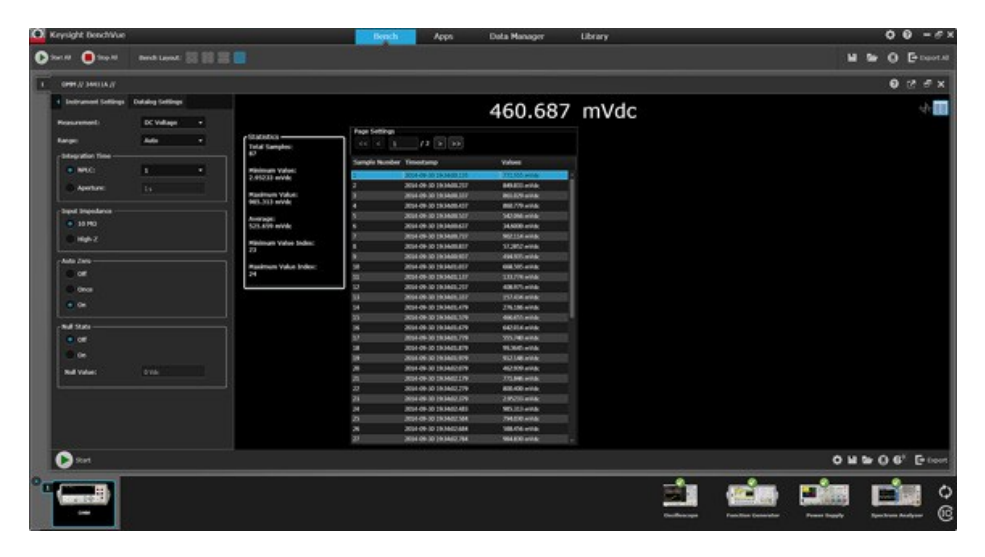
Figure 2. BenchVue enables control of your DMM to data log and visualize measurements in a wide array of display options.