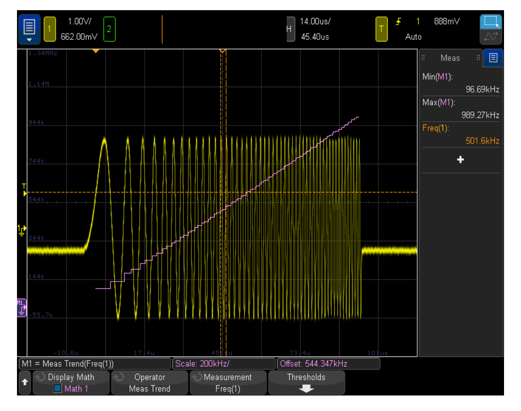
Figure 10. Measurement trend math function used to plot frequency versus time of a FM burst.