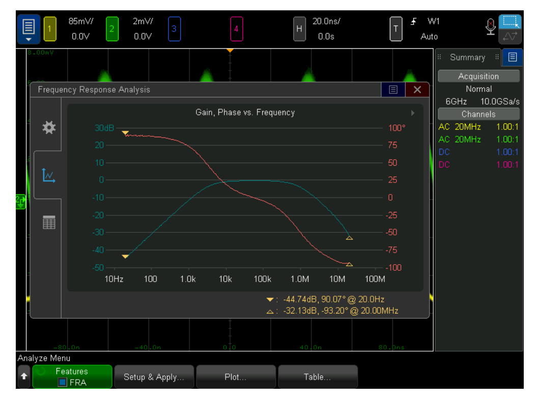
Figure 8. Frequency response analysis (gain & phase) on a bandpass filter.