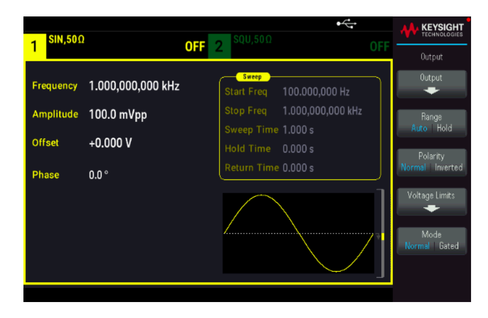
Figure 1. Standard since wave and setting