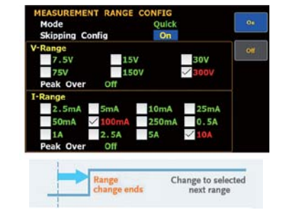
Self-defined automatic level-changing mechanism

tion function underself-defined setting mechanism for level-changing. Users can select thefully calculate therequired level to be changed to save time on level-changing and expeditem the beginning tothe test.