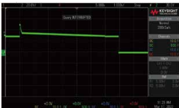
LDC302 28V abnormal voltage transients (overvoltage)