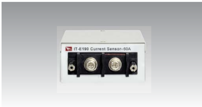
IT-E190-60A Current sensor Applicable models:ITS9500,IT9121