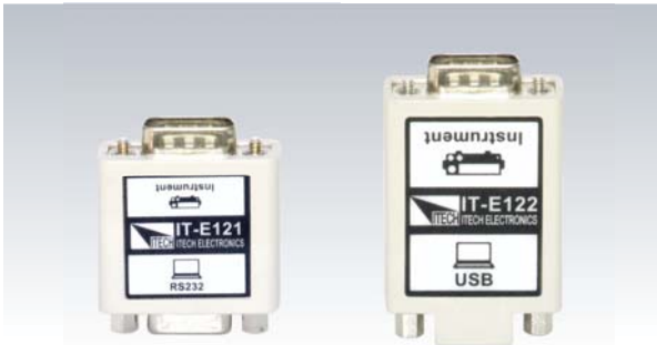
IT-E121 RS232 Communication interface, with RS232 standard communication cable IT-E122 USB Communication interface, with USB standard communication cable Applicable models: IT6100, IT6800, IT6322 IT6302, IT8500+, IT8500