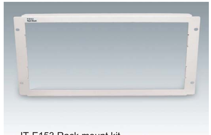
IT-E153 Rack mount kit Applicable models: IT8700 series