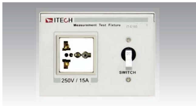
IT-E185 The testing fixture box (250V/15A) Applicable model:IT9121