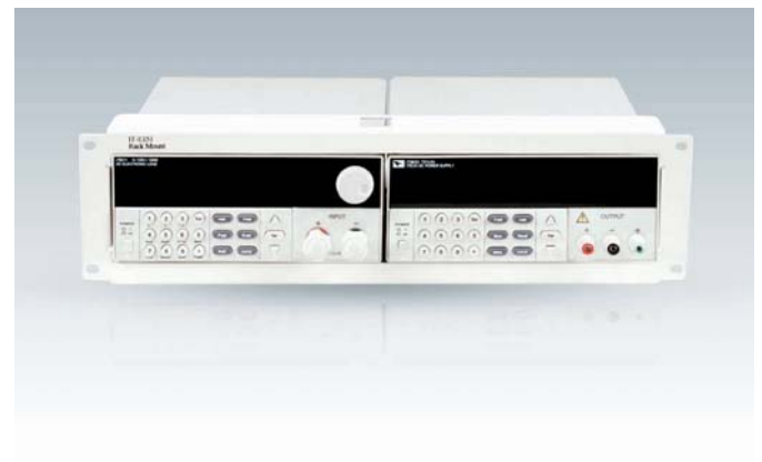
1/2 2U Double units installation picture