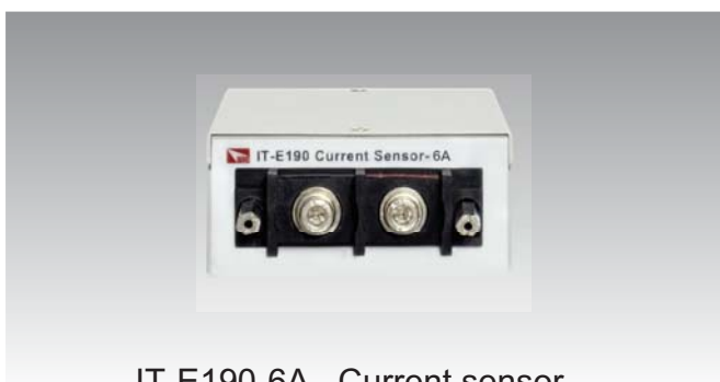
IT-E190-6A Current sensor Applicable models:ITS9500,IT9121