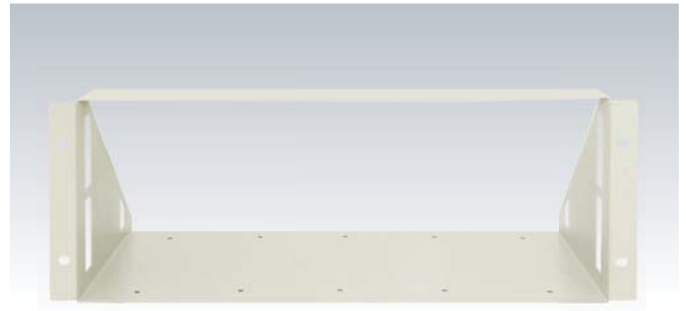
IT-E152 Rack mount kit Applicable models: IT8200 and IT6700 series