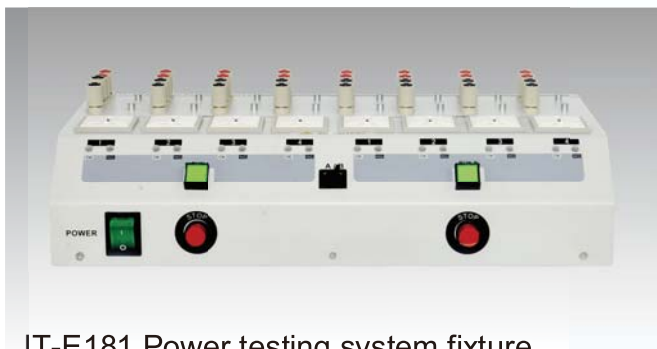
IT-E181 Power testing system fixture (Realizing 4 channels synchronous testing) Applicable model:ITS9500