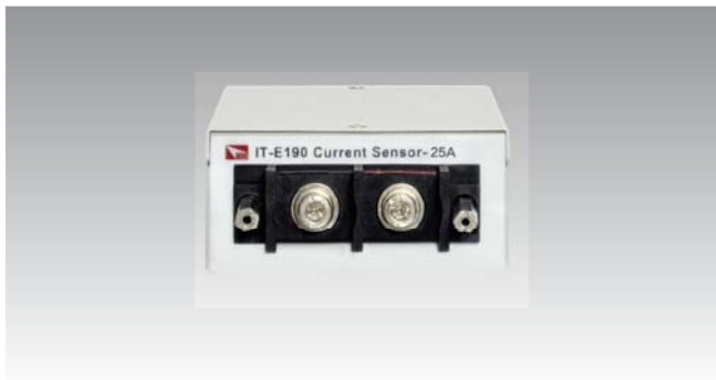
IT-E190-25A Current sensor Applicable models:ITS9500,IT9121