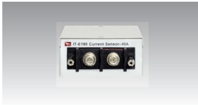
IT-E190-40A Current sensor Applicable models:ITS9500,IT9121