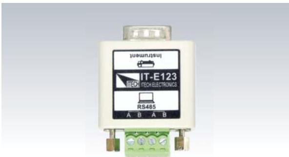
IT-E123 RS485 Communication interface, with RS485 interface Applicable models: IT8500+, IT8500, IT6800 IT6100, IT6322