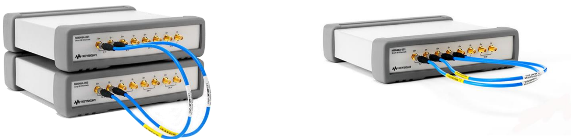
Figure 7: Short matched SMA cable pair for cascading ISI channels from two units or within one unit.