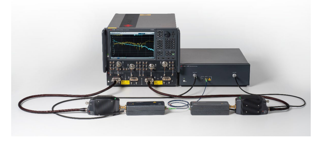
Figure 1: N4372E system setup

The N4372E extends Keysight's LCA family for high frequency parametric testing of optical TX and RX up to 110 GHz. It is the only electro-optic vector network analyzer system realizing both E-to-O and O-to-E S-parameter measurements up to 110GHz.