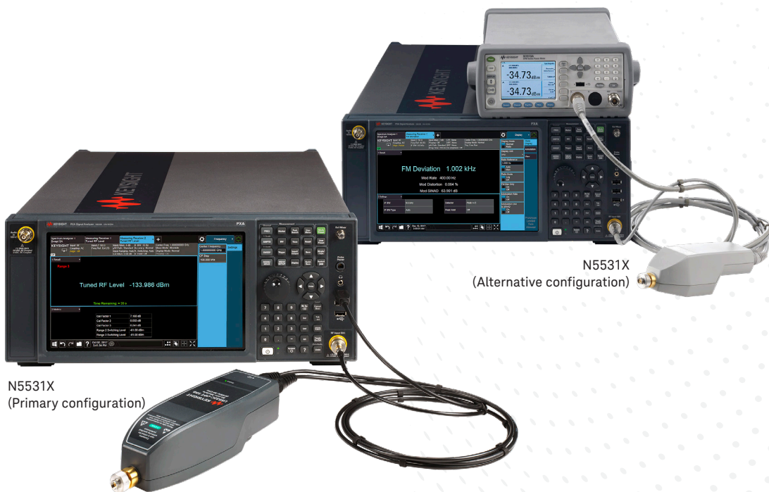
N5531X (Primary configuration)