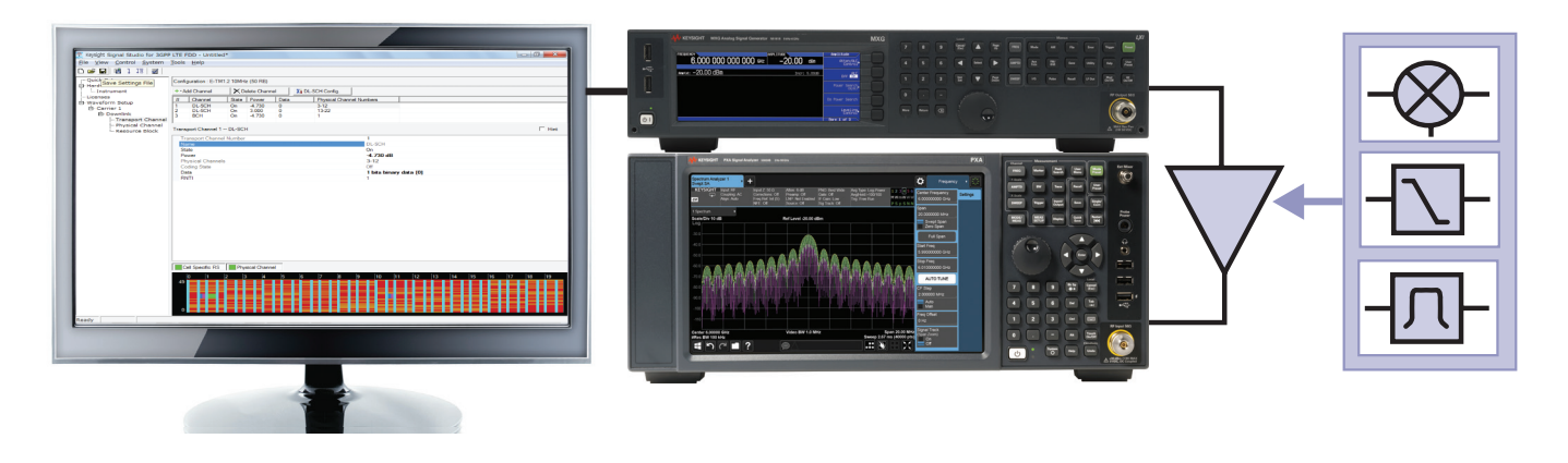
Figure 1. Typical component test configuration using Signal Studio's basic capabilities with a Keysight X-Series signal generator and an X-Series signal analyzer.

Signal Studio's basic capabilities enable you to create and customize a variety of WLAN 802.11 waveforms including 802.11a/b/g/j/p/n/ac/ah/ax/be to characterize the power and modulation performance of your transmitter or receiver components, such as amplifiers and IQ modulators. Easy manipulation of a variety of signal parameters, including standard format, transmission bandwidth, guard interval, data rate, and modulation type, simplifies signal creation.