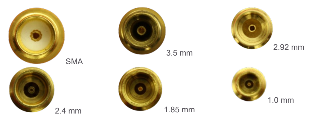
Figure 26. Typical female input connectors