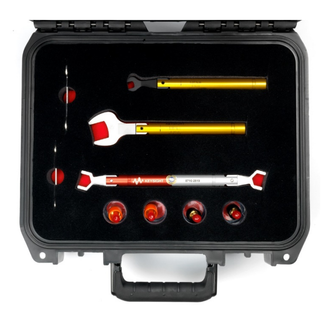
Figure 3. N1060A-60005 accessory kit