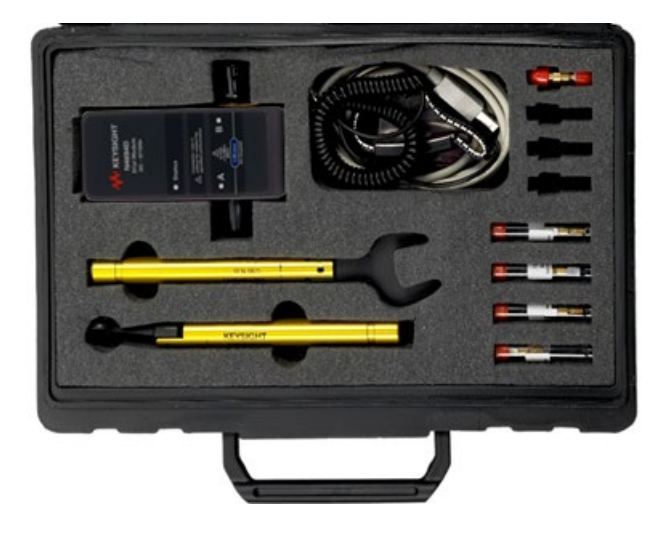
Figure 4. N1027A-54F accessory kit