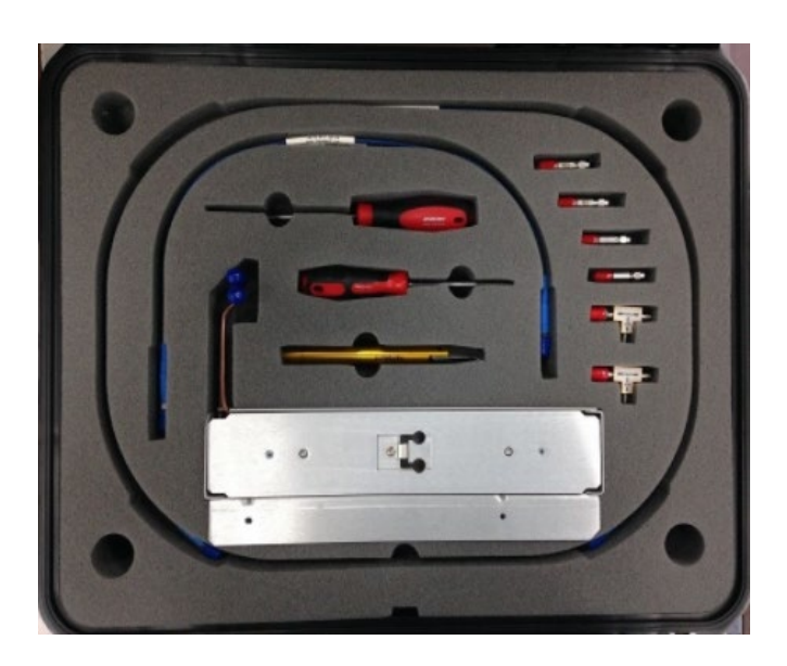
Figure 7. N1076B-CR1/N1027A-76B accessory kit