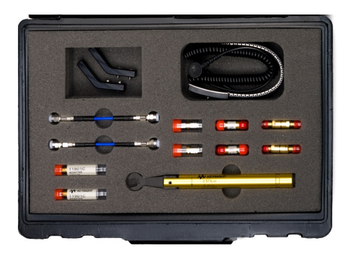
Figure 1. N1027A-45A demo kit