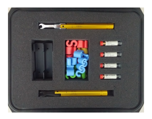
Figure 2. N1027A-A4F accessory kit