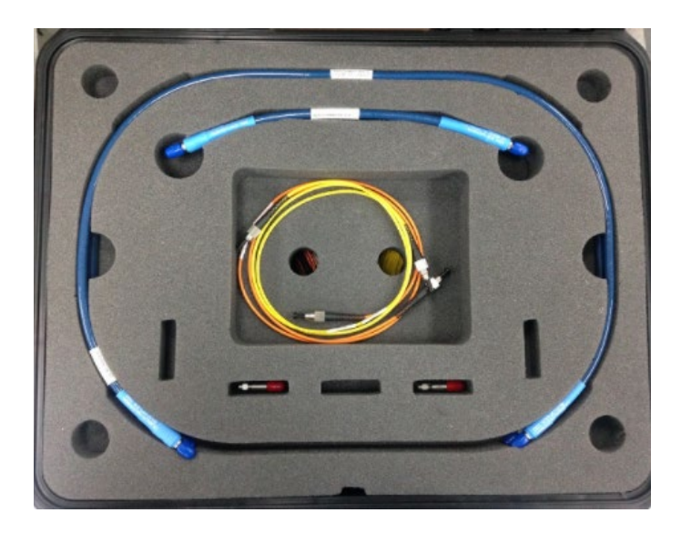
Figure 8. N1077A-CR1/N1027A-77A accessory kit