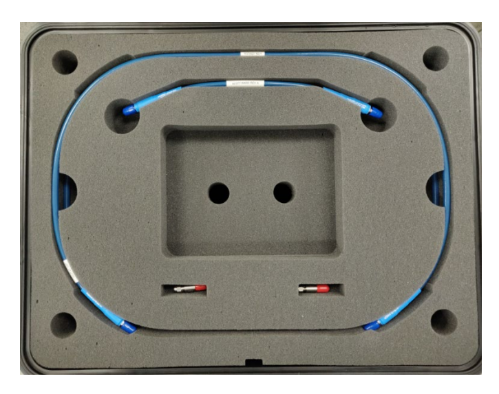
Figure 9. N1078A-CR1/N1027A-78A accessory kit