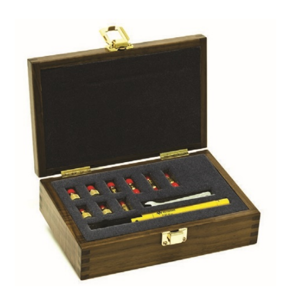
Figure 6. 85058E economy mechanical calibration kit

All kits provide SOLT calibration except the N1024B which is limited to SLT.