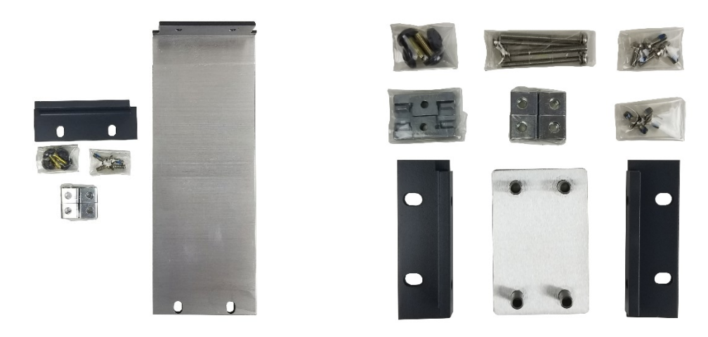
Figure 20. N1027A-RM1 (left) and N1027A-RM2 (right)