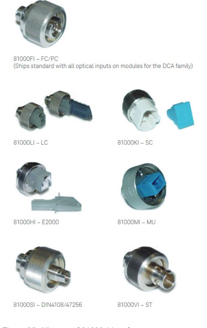
Figure 25. All types of 81000xl interfaces

The 81000xl interfaces are not used on N107XX Clock Recovery and N109XX DCA-M instruments.