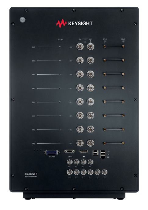
Propsim F8 Channel Emulator