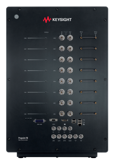
Propsim F8 Channel Emulator