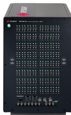
Figure 2. F8800ARF2 PROPSIM F64