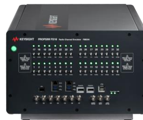
Figure 1. F8820A PROPSIM FS16