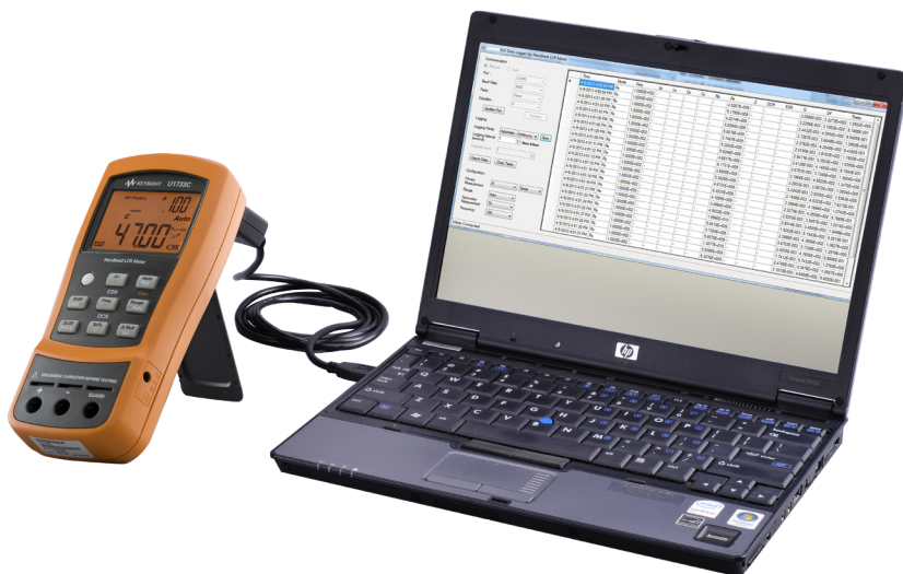
Figure 1. Automate the recording of continuous readings when you hook the U1731C/U1732C/U1733C to a PC

The handheld LCR meters allows you to test various component types, including secondary components of Dissipation Factor (D), Quality Factor (Q), and Angle Indication of Impedance ( \theta ). This new handheld series also includes other functions that result in a more detailed component analysis. For example, the built-in Equivalent Series Resistance (ESR) function helps you better understand the inherent resistance behavior typically found in capacitors across selected frequencies. DCR is a built-in DC resistance measurement that eliminates the use of a separate digital multimeter (DMM) for component test.