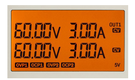
Figure 2. Backlight on/off feature with dual reading (voltage and current) on an LCD display