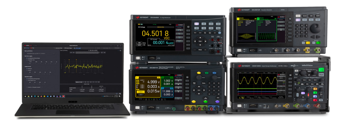
Figure 6. Keysight PathWave BenchVue software controlling the Smart Bench Essential Series instruments

Learn more about Keysight Smart Bench Essential Series and PathWave software.