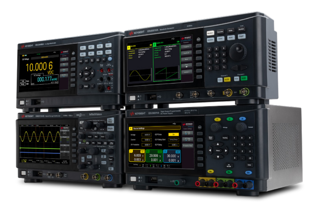
Figure 2. Large screen with a consistent and intuitive graphical user interface